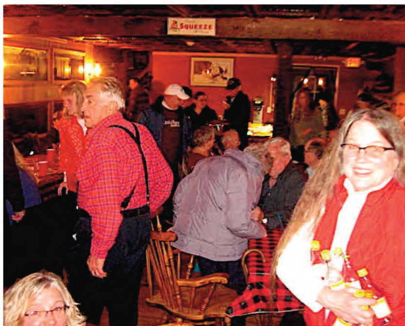
American Legion faithful, family and friends gathered at the Prattsville Hotel, earlier this week, to honor the Legion's "Centennial" and enjoy their annual Christmas party.

continued on C8.