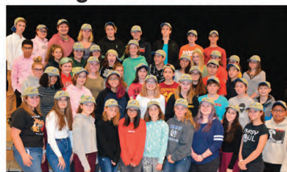
Students received these 20th Anniversary hats from the Community of Windham Foundation, celebrating their hometown radio station and showed them off during the photo op. During the check presentation one member of the chorus offered an impromptu rendition of a WRIP jingle.