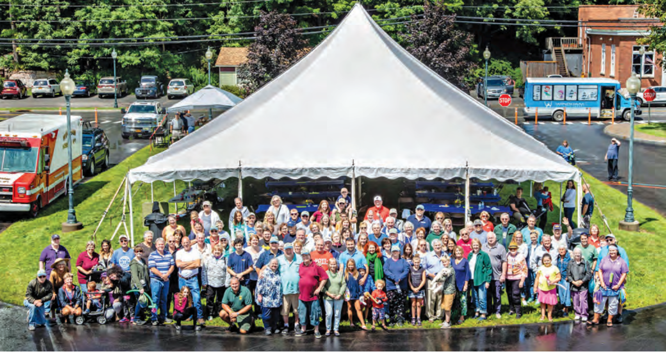
“Thank you” said hundreds of visitors to the 20th anniversary celebration for WRIP radio, many of whom gathered for a community photograph at Windham-Ashand-Jewett school, site of the party, last Saturday.